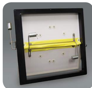
CAI-2700 Ceiling Inlet