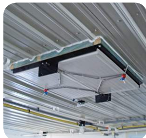
ACI-2700P Actuated Ceiling Inlet