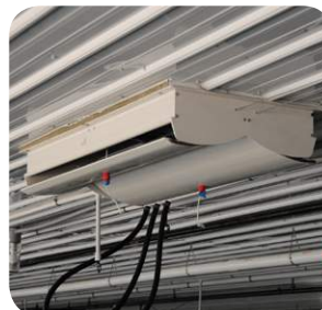
ACI-4000P2 Actuated Ceiling Inlet

* Based on a six site evaluation in Iowa, from October 2010 thru April 2011, an average 21.76% propane savings were realized with the use of AP's actuated inlets versus counterweighted. (ACI-4000P2 vs. I-2000)