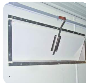
CBIA-3000 Counterweighted Baffle System