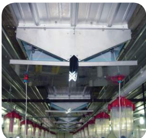
ACI-2-4000 Actuated Ceiling Inlet