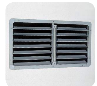
BIL3000 and 4000 second stage shutter type wall inlets available.