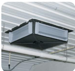
C-2000 Ceiling Air Inlet