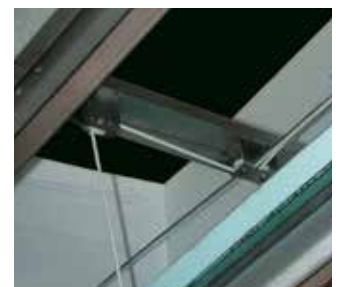
Actuated ceiling inlets include factory installed pulleys