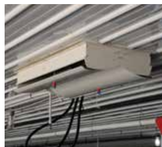
ACI-4000P2 ACTUATED CEILING INLET