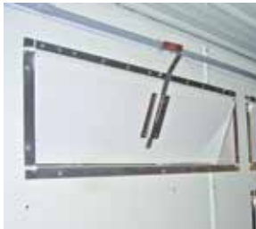
CBIA-3000 COUNTERWEIGHTED BAFFLE