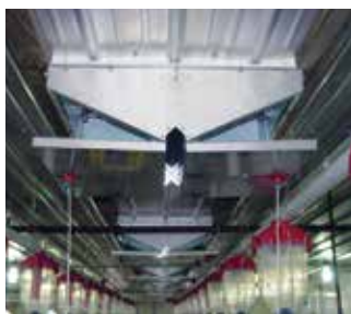
ACI-2-4000 ACTUATED CEILING INLET