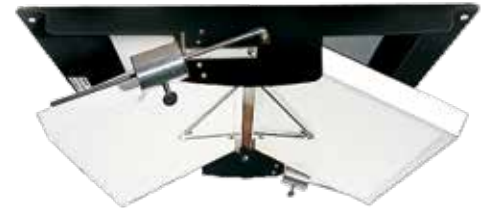
BI-FLOW CEILING INLET