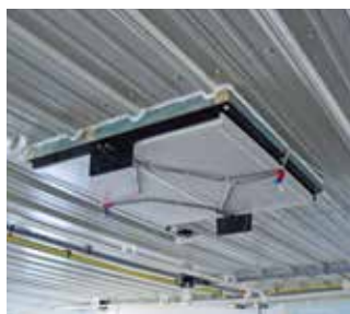
ACI-2700P ACTUATED CEILING INLET