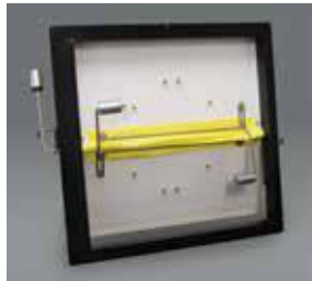
CAI-2700 CEILING INLET

All AP Inlets are pressure wash friendly for easy cleaning