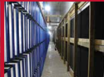
Positive Pressure Systems