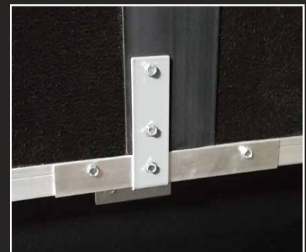
T-Bracing at panel connection points adds rigidity