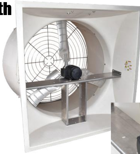
ALUMINUM MOTOR MOUNTS, STAINLESS STEEL HARDWARE AND NON-CORROSIVE PROPS