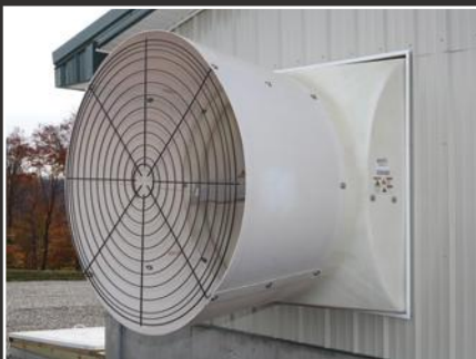
Durable fiberglass and poly cone options

Plan your next ventilation strategy with the 36" or 54" Commander direct drive fans built for high efficiency, high output, and remote access through your EDGE® control system.