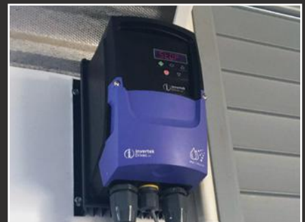
Industry leading drive allows for the use of failsafe relays or back-up thermostats as required.