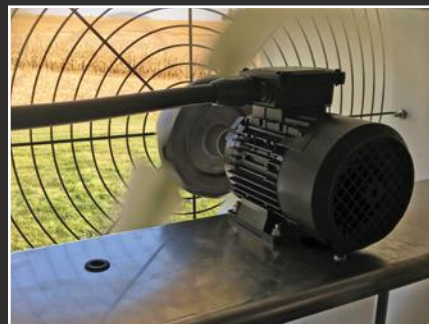
High performance, permanent magnet motor runs cool to the touch and supplies constant torque to the propeller.