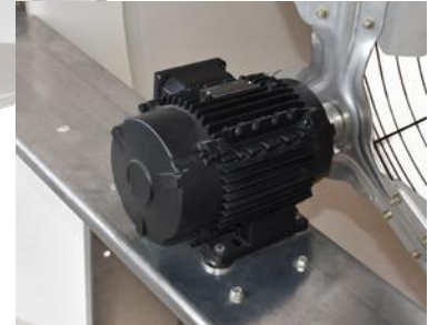
HIGH PERFORMANCE, PERMANENT MAGNET ELECTRIC MOTOR DESIGN